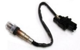
Sensor Insert Adapter